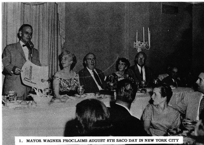
1. MAYOR WAGNER PROCLAIMS AUGUST 8TH SACO DAY IN NEW YORK CITY