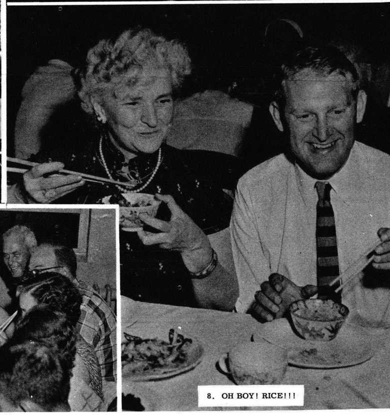
8. OH BOY! RICE!!!