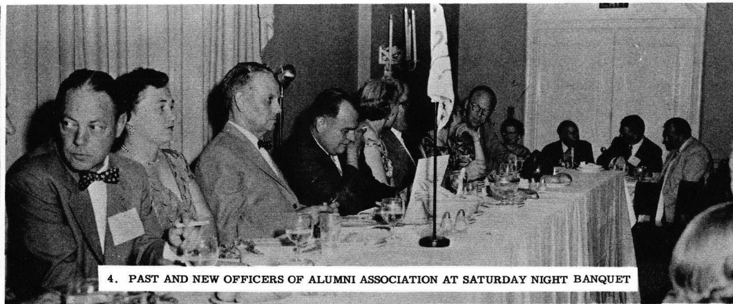
4. PAST AND NEW OFFICERS OF ALUMNI ASSOCIATION AT SATURDAY NIGHT BANQUET