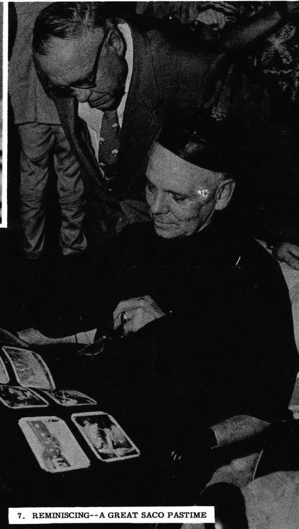
7. REMINISCING-- A GREAT SACO PASTIME