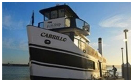
CORONADO ISLAND FERRY – to dinner - IL FORNAIO CUCHINA