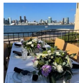
CORONADO ISLAND FERRY – to dinner - IL FORNAIO CUCHINA

SATURDAY – Reception Dinner at the Embassy Suites - non-SACO members $150